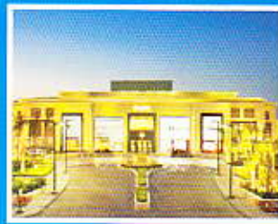
DLF Emporio Mall