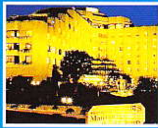
Hotel Maurya Sheraton, New Delhi