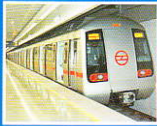
Delhi Metro Rail Corporation (DMRC)

B.E.C. conduit pipes are designed for electrical piping systems used for protection and routing of electrical wiring. B.E.C. conduit pipes can be used under all atmospheric conditions for all occupancies for concealed exposed wiring, in Thermal and Gas Plants, for high volume installation, for buried underground and for wet saline tracks. At present, B.E.C. pipes are being used in all leading hotels, hospitals, domestic and international airports, sports stadia, shopping malls, government and private thermal power plants in India.