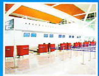
Indira Gandhi International Airport